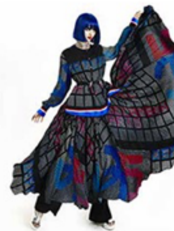
Silk printed collarless shirt over a full matching skirt and wide legged trousers. Metal choker, pins and open toe boots, Chanel ( chanel.com )