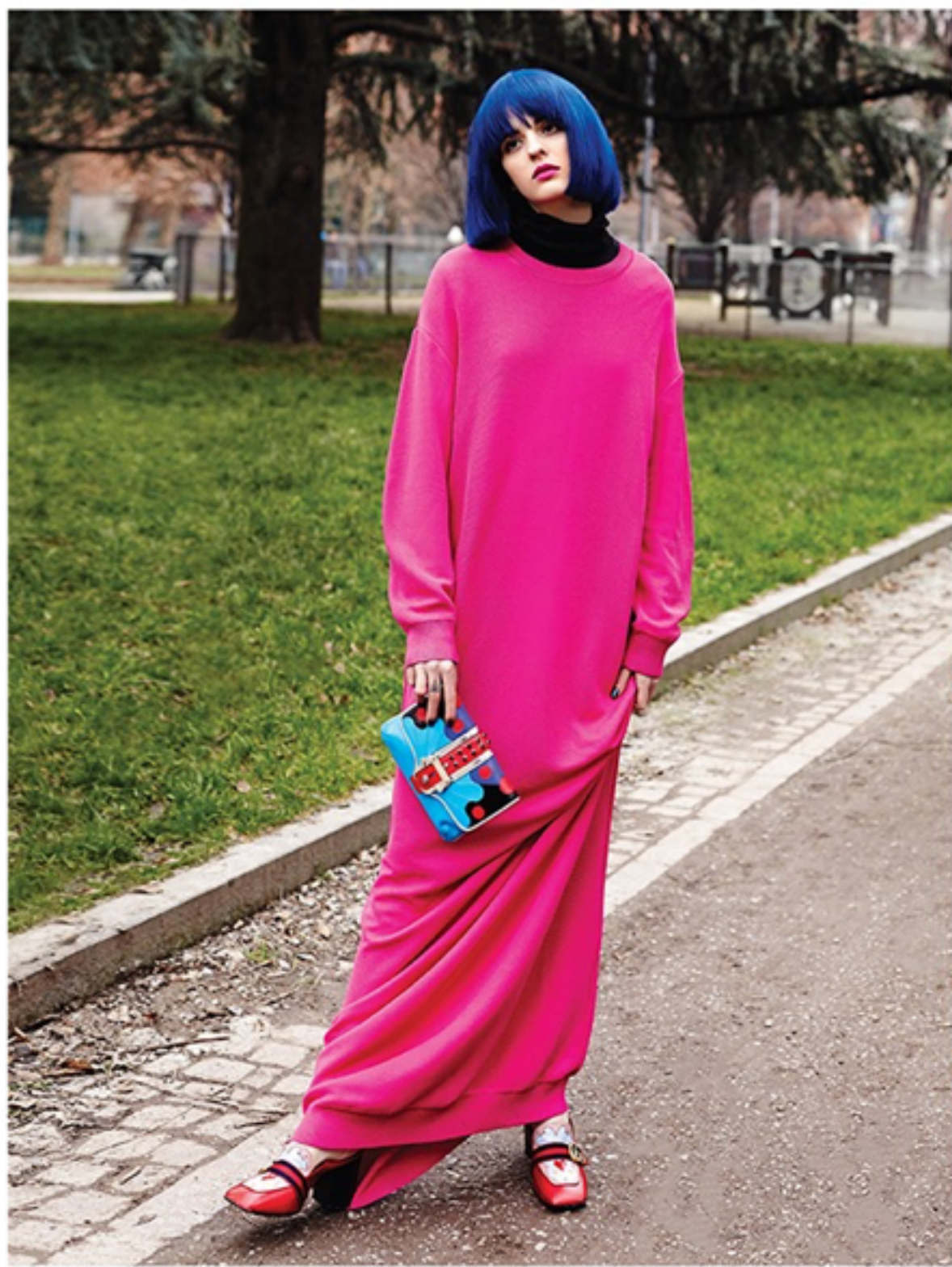
Viscose crewneck dress Dsquared2 (dsquared2.com) and polo neck, Petit Bateau (petit-bateau.com). Mules, Gucci. Clutch Paula Cademartori (paulacademartori.com)