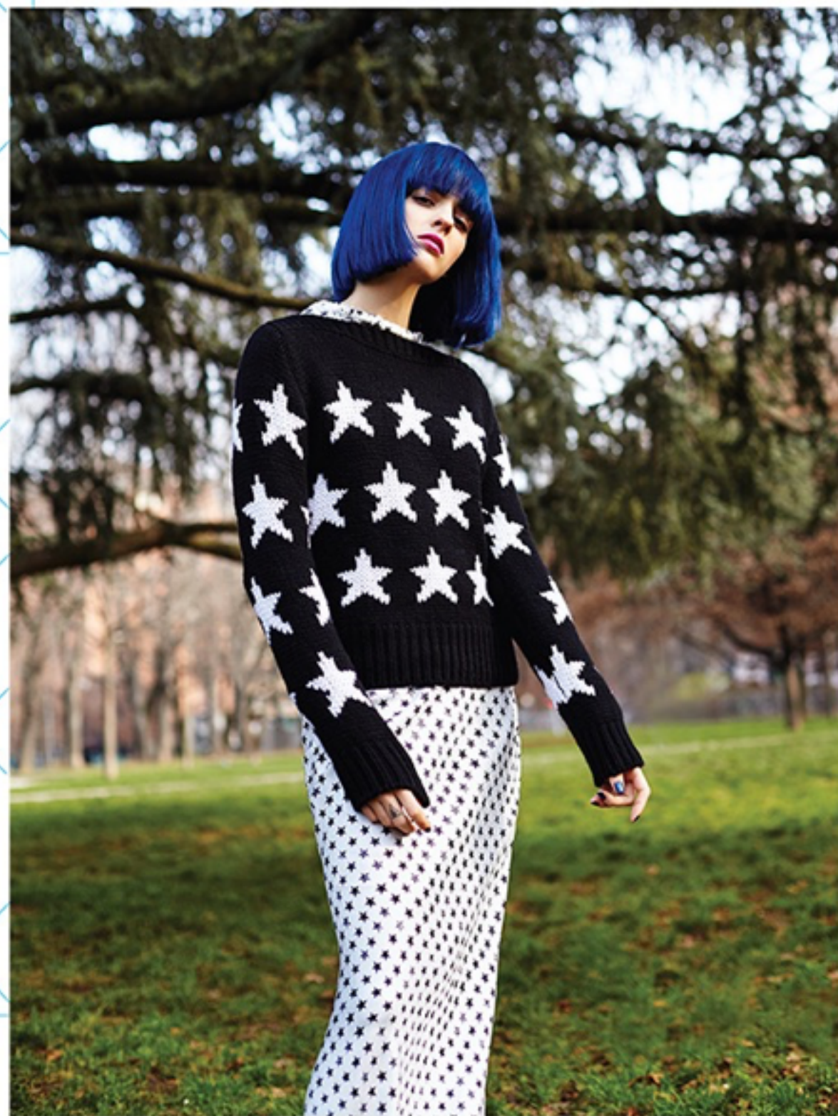
Hand knitted cotton sweater over a long printed silk slip dress, Max Mara ( maxmara.com )