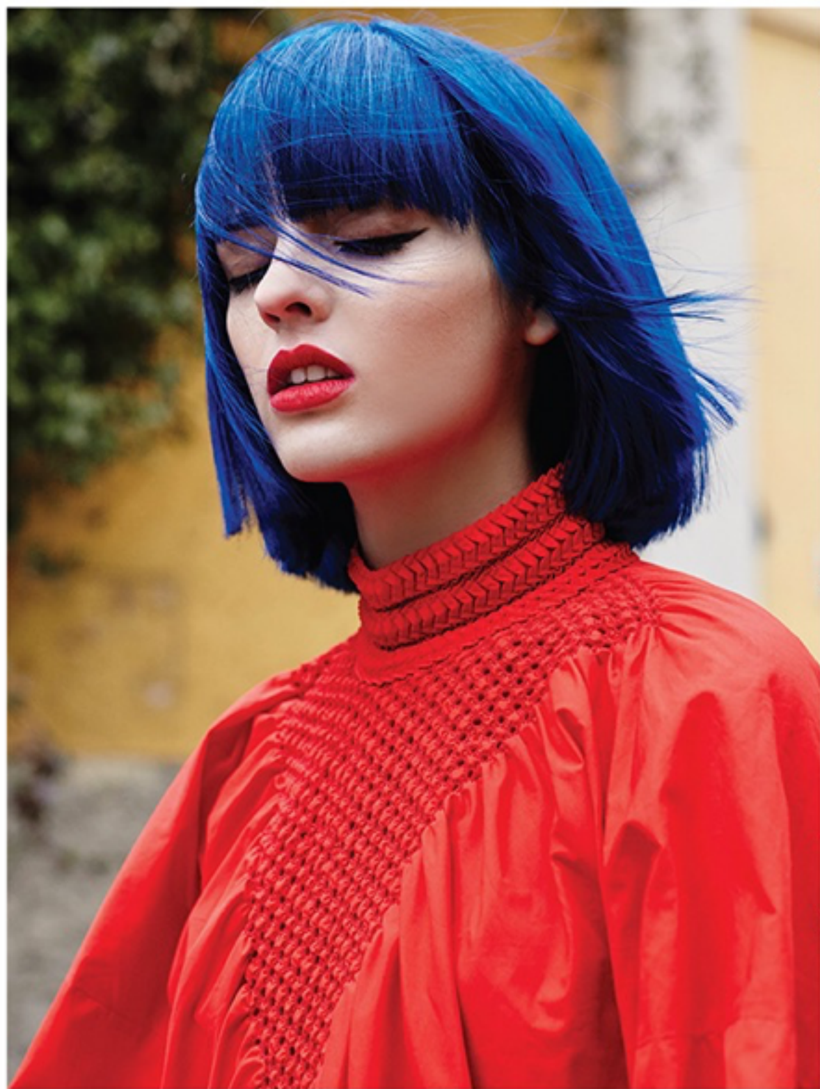
Sita wears an high neck cotton dress with smock embroidery on the front and the cuffs, Fendi ( fendi.com )