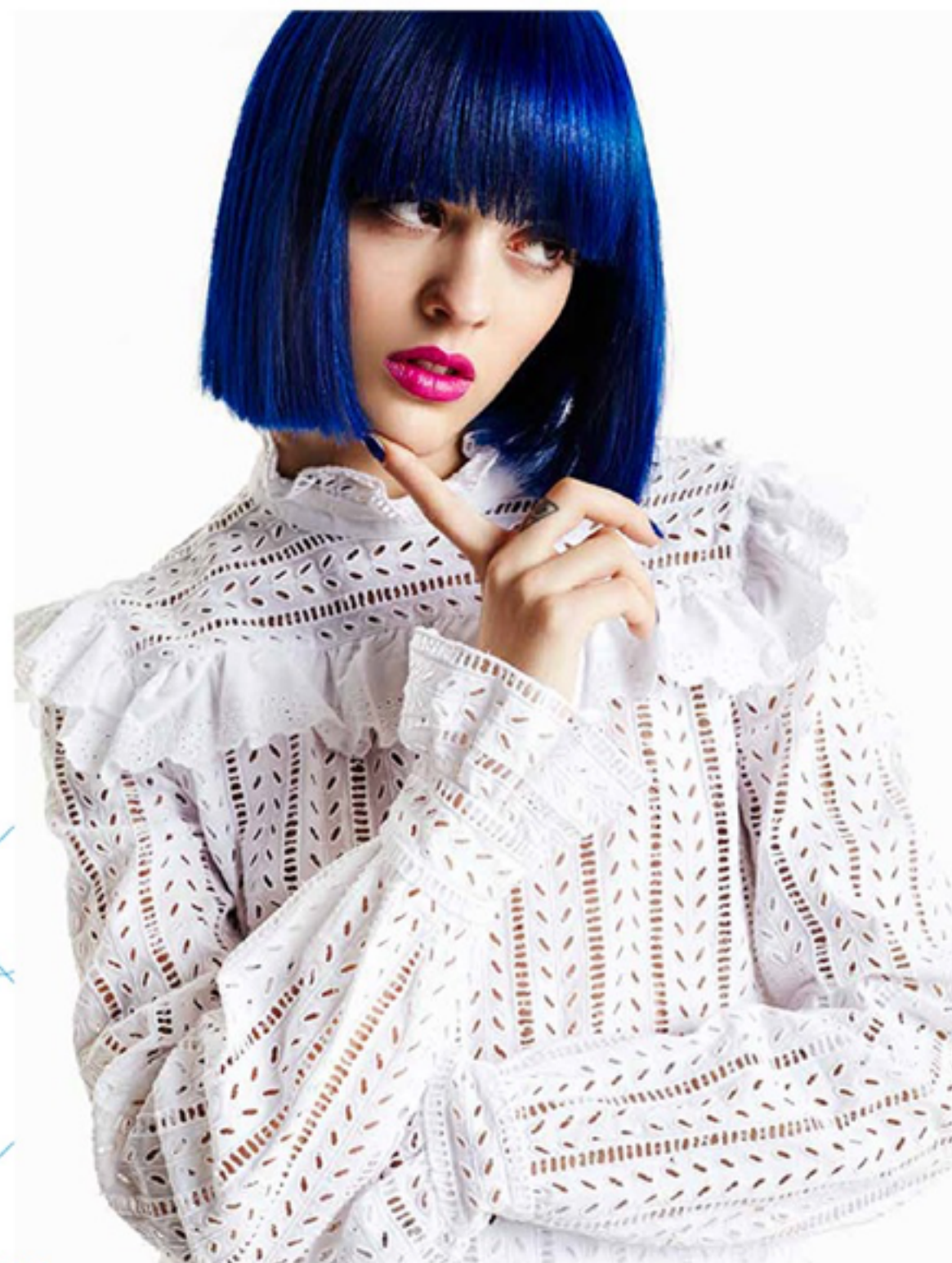
High neck cotton broderie anglaise top with ruffles at the neck and cuffs, Philosophy di Lorenzo Serofini (philosophyofficial.com)