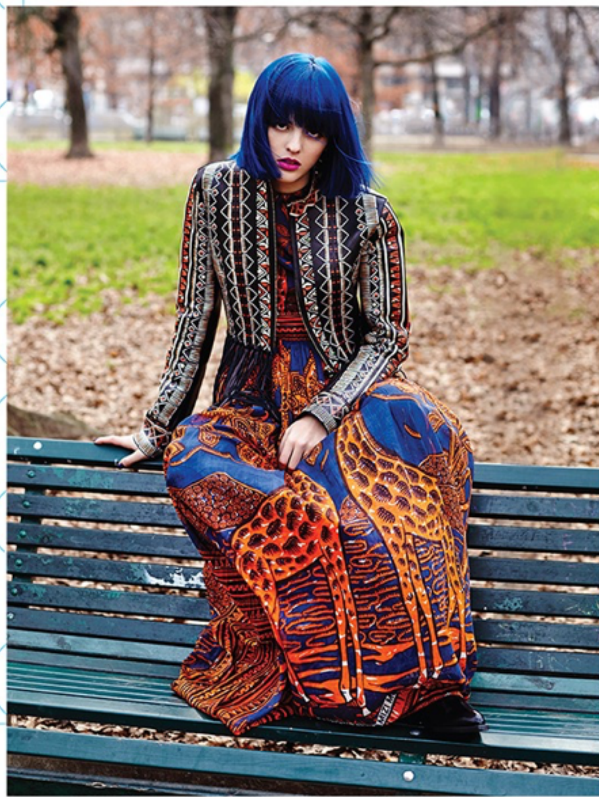
She wears hand painted leather jacket and wax printed cotton dress Valentino (valentino.com). Cowboy boots Philosophy di Lorenzo Seralini