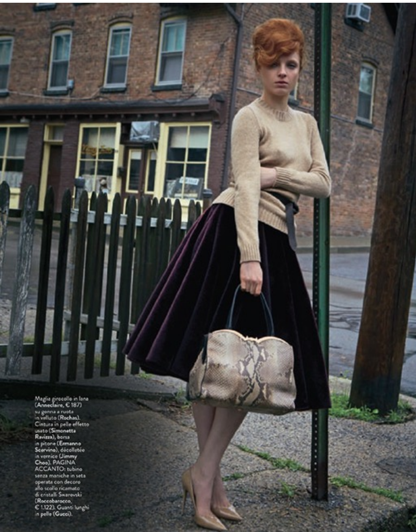
Maglia girocollo in lana (Anneclaire, € 187) su gonna a ruota in velluto (Rochas). Cintura in pelle effetto usato (Simonetta Ravizza), borsa in pitone (Ermano Scervino), décolletée in vernice (Jimmy Choo). PAGINA ACCANTO: tubino senza maniche in seta operata con decoro allo scollo ricamato di cristalli Swarovski (Roccobarocco, € 1.122). Guanti lunghi in pelle (Gucci).