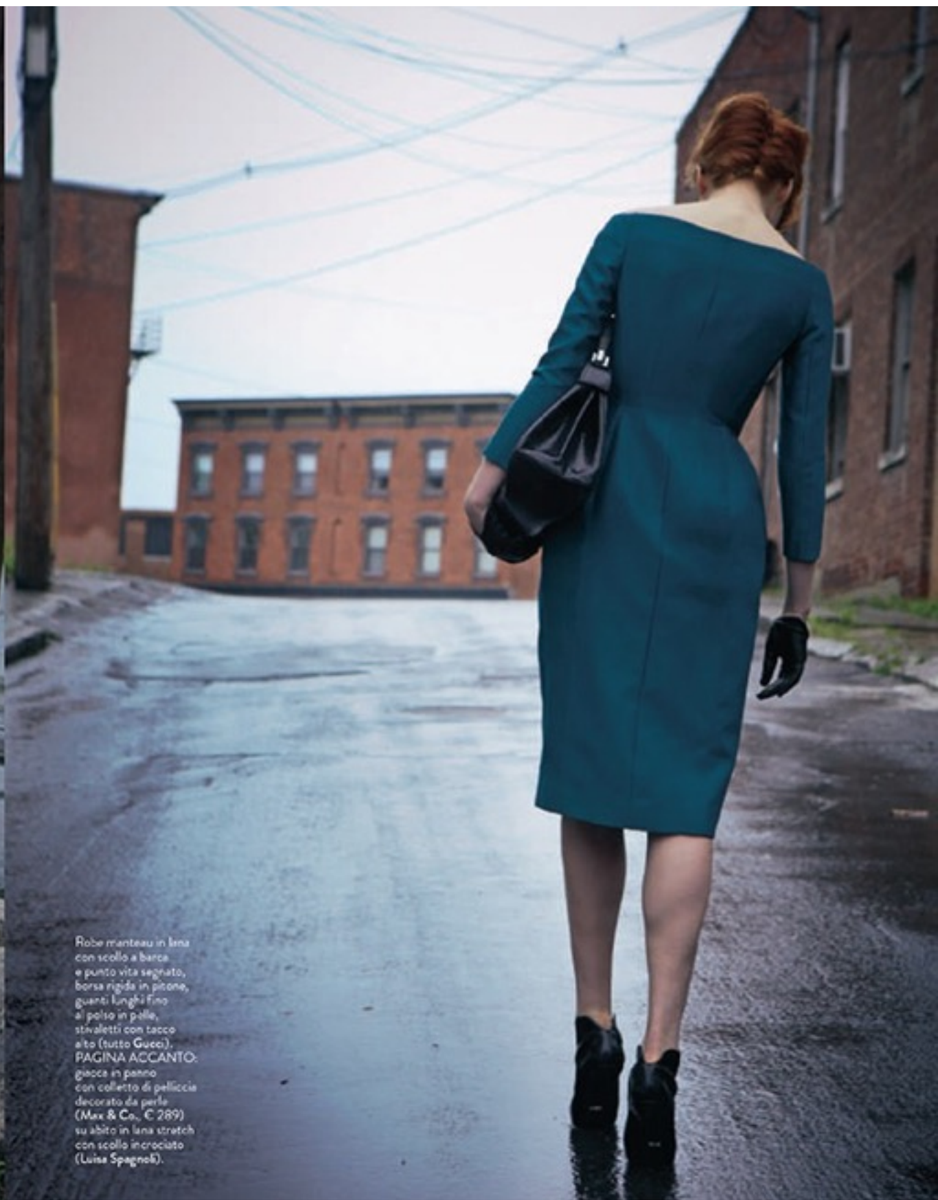
Robe manteau in lana con scollo a barca e punto vita segnato, borsa rigida in pitone, guanti lunghi fino al polso in pelle, stivaletti con tacco alto (tutto Gucci). PAGINA ACCANTO: giacca in panno con colletto di pelliccia decorato da perle (Max & Co., € 289) su abito in lana stretch con scollo incrociato (Luina Spagnoli).