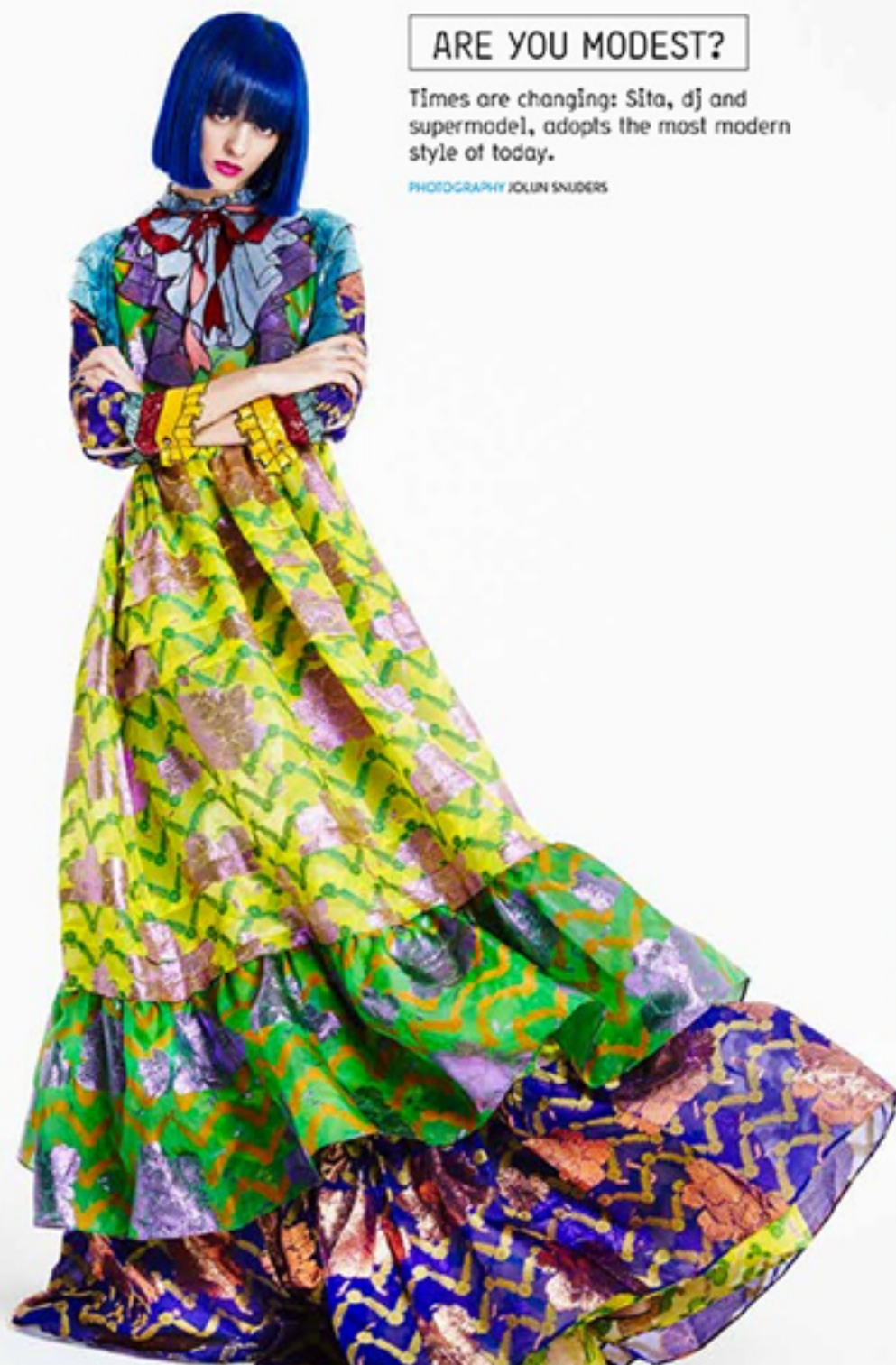
Sita wears a long dress in cotton and lurex with trompe l'oeil bow, cuffs and belt, Gucci (gucci.com). Fashion Michela Grasso