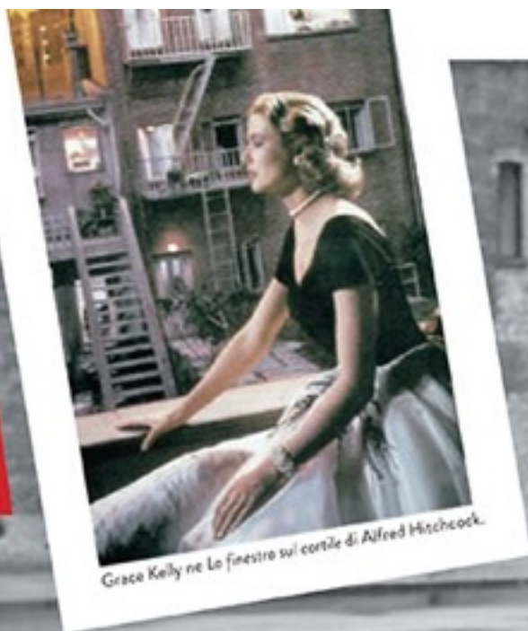
Grace Kelly ne Le finestra sul cortile di Alfred Hitchcock.

Sofisticata UN'ELEGANZA FATTA DI SILHOUETTES FEMMINILI E SOBRIE, POCHI GIOIELLI E TACCHI ALTI. APPARENTEMENTE FREDDA E DISTACCATA, FA RIVIVERE IL GUSTO DELLE ATTRICI DI ALFRED HITCHCOCK